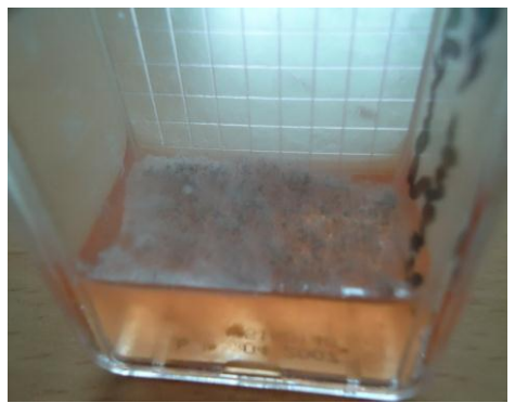
Figure 1. Fungal growth in growth medium.

N.B.: +++ indicates rapidly cured, ++ indicates moderately cured, + indicates slowly cured and - indicates not cured.