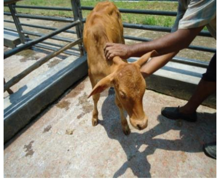
Figure 2. Acute case before (left) and after (right) treatment.