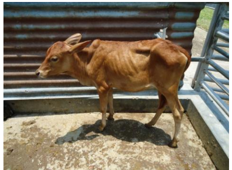
Figure 3. Chronic case before (left) and after (right) treatment.