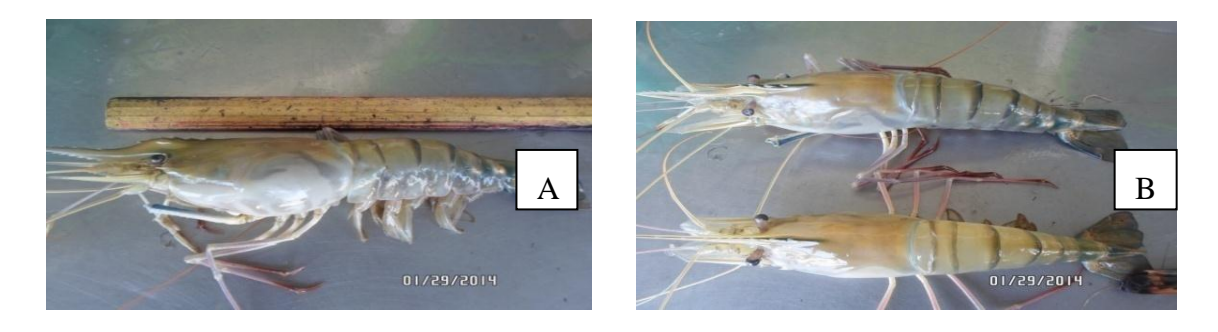
Figure 2. Clinical appearance of shrimp in the study area.