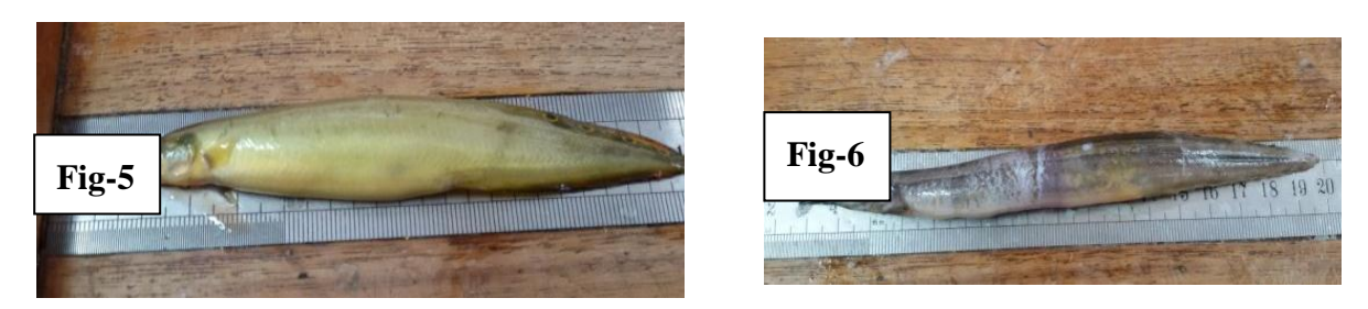
Figure 5. M. aculeatus obtain from Kailla beel in the month of March-April. Almost healthy appearance.

Figure 4. L. guntea obtain from Kailla beel in the month of December. hemorrhage in gill, Fin and total tail loss and Red spot and mass lesion in ventral region were seen.