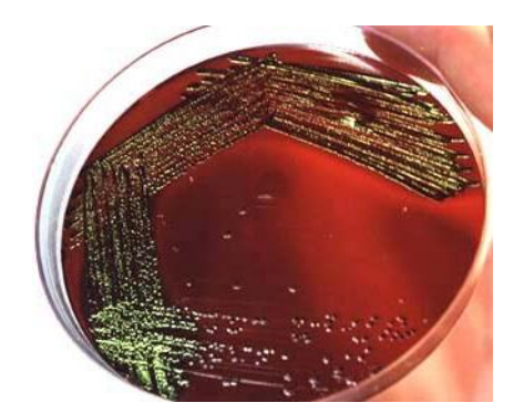
Figure 2. Escherichia coli on EMB agar with metallic sheen.