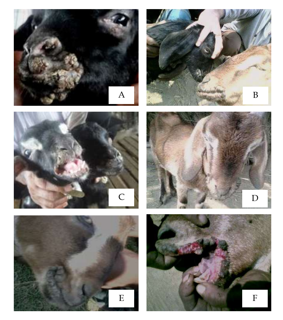
Figure 1. Clinically affected and/or suspected contagious ecthyma in goat. A. Lesions in lips, nostril and eyelid of a kid; B. Infected kid and dam; C. Two kids infected; D. and E. Adult animal infected; F. Lesions after taken sample.