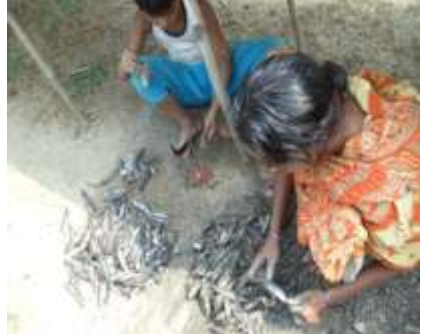
Figure 3. Method of traditional fish drying.