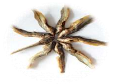
Figure 2. Salt-smoke-dried tengra fish.