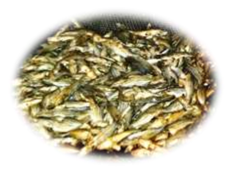
Figure 1. Salt-smoked tengra fish.