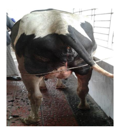
Figure 1. Cow before surgery.