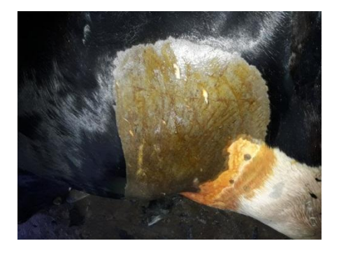
Figure 2. Cleaning and shaving of surgical site of the cow.