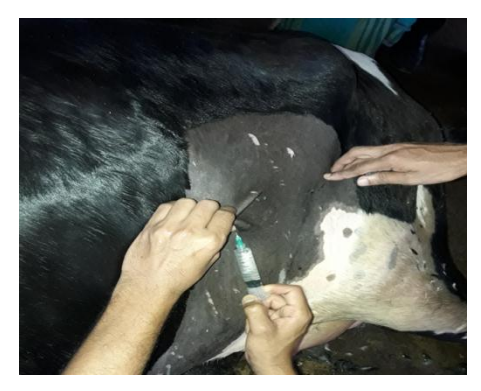
Figure 3. Adminitrating local anaesthetic at the site of incision.