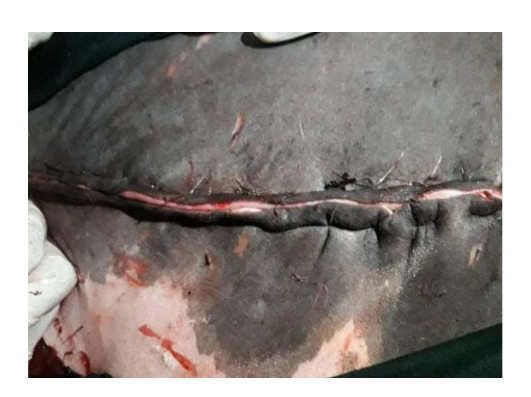
Figure 10. Horizontal mattress suture pattern on skin.