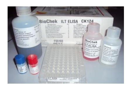
chemicals and reagents used for ELISA.