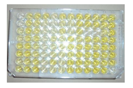
Figure 5. Yellow color was developed in positive case.

Figure 4. Diluted serum containing ILT antigen coated plate with negative, positive and reference control.