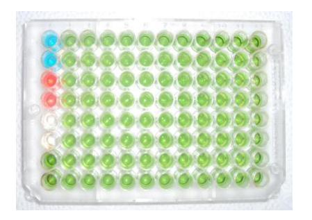
Figure 4. Diluted serum containing ILT antigen coated plate with negative, positive and reference control.