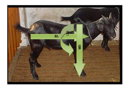
Figure 1. Different body measurement of BBG: BL=Body Length, HG=Heart Girth and WH= Wither Height