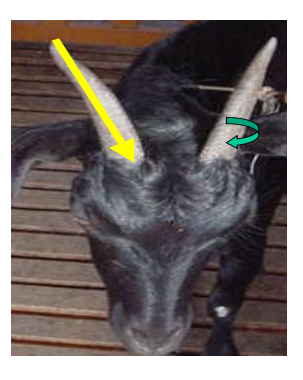
Figure 2. Head length, breadth, Horn length, circumference and Horn distance measurement of BBG.