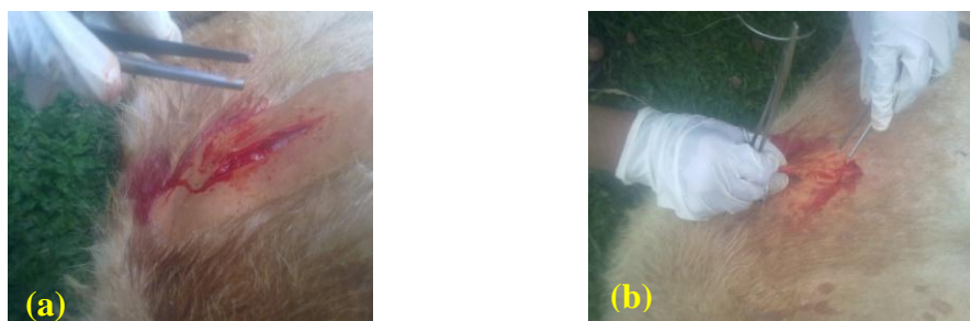
Figure 1. Fresh surgical wound just after incision (a) and suturing of incised wound as horizontal mattress pattern (b).