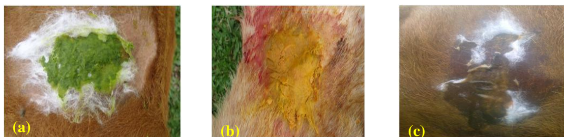
Figure 2. Application of durba paste (a), turmeric paste (b) and benzoin (c) on sutured wound.