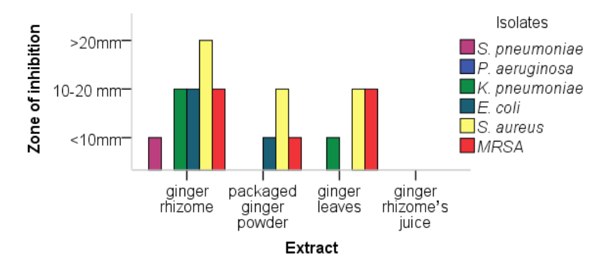
Figure 1. Antimicrobial effect with ZOI of the extracts (R, P and L) and J against pathogens.