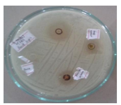
Figure 3. Antimicrobial activity screening against S. aureus .

Ginger extracts R, P, L were potent against MRSA while MRSA is resistant towards J.