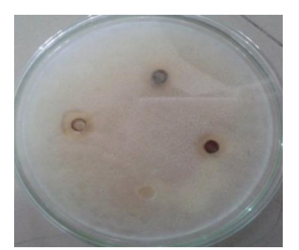
Figure 2. Antimicrobial activity screening against MRSA.

Ginger extracts R, P, L were potent against MRSA while MRSA is resistant towards J.