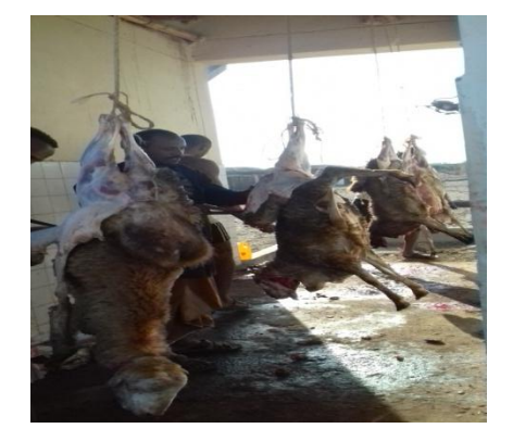
Figure 3. During slaughtering at Dubti livestock barn.