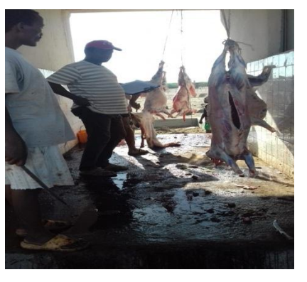
Figure 2. During carcass measurement at Dubti.