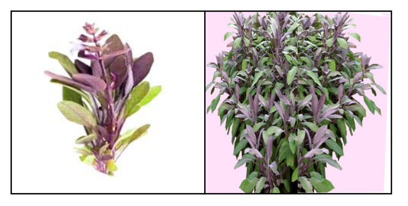
Figure 2. Common sage (Salvia officinalis).